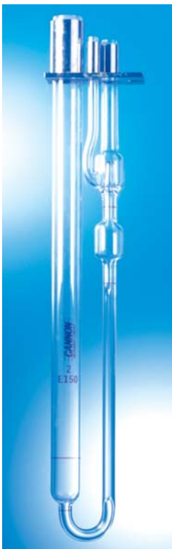
9723-C50 Series 9723-D50 Series

Similar to 9723-B50 series, but uncalibrated.