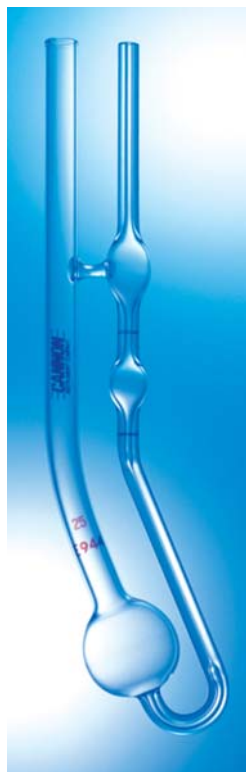
9721-A50 Series 9721-B50 Series