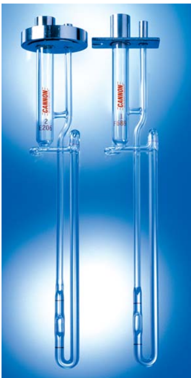
9723-W50 Series 9723-Y50 Series 9724-B50 Series 9724-D50 Series

Similar to 9724-B50 series, but have constant within \pm 0.2\% of value listed in table on page 9.