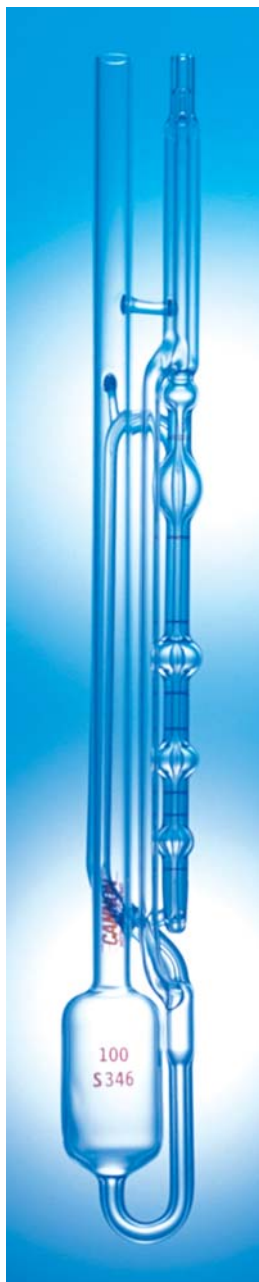
9723-L50 Series 9723-M50 Series 9723-N50 Series