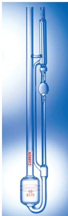
9721-J50 Series 9721-K50 Series

Holder is not supplied. For holders, see 9726-M70, -M73, and -M76 on page 15.