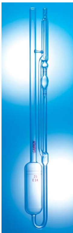
9722-L50 Series 9722-M50 Series