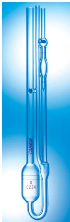
9721-N50 Series 9721-R50 Series 9721-U50 Series