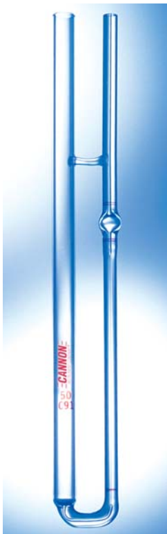
9721-X50 Series 9721-Y50 Series