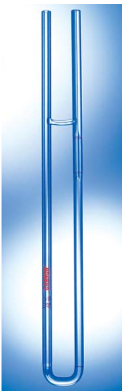
9722-C50 Series 9722-D50 Series