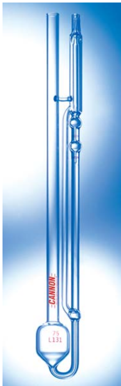
9722-G50 Series 9722-H50 Series