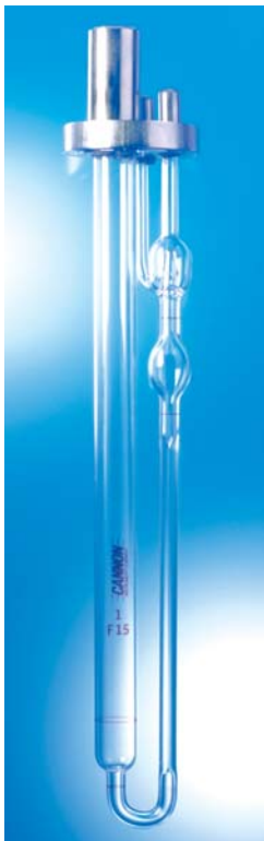
9723-A50 Series 9723-B50 Series