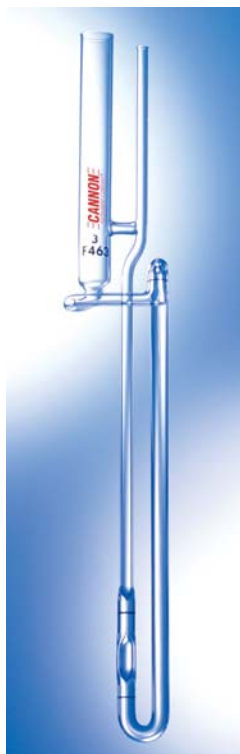
9723-S50 Series 9723-U50 Series