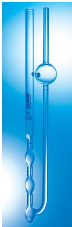
9721-E50 Series 9721-F50 Series